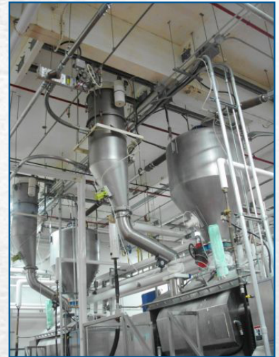
VAC-U-MAX Vacuum Conveying System pneumatically conveying food ingredients to processing line. Material is contained within the system minimizing plant and personnel exposure to dusts and combustible dusts, eliminates manual refill of process equipment - maximizes safety & production.

Flexible screw conveyors move less material than aero-mechanical conveyors, but they operate continuously, unlike the aero-mechanical. A common use for aero-mechanical systems is batch processing; and, a flexible screw is ideal for continuous, batch, or intermittent processing. Both can convey 2000lbs of material into a mixer in 10 minutes, however, the flexible screw conveyor can operate continuously. Aero-mechanical conveyors require metered in-feed and must start-up and finish without material in the tubes. Flexible screws can be started and stopped with a headload of material at the feed end.