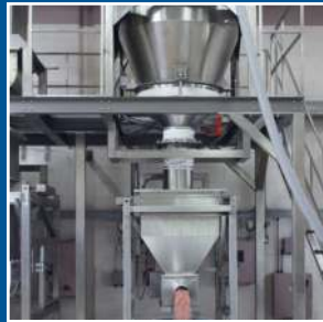
Screw, Belt, Vibratory Tray Feeder Refill