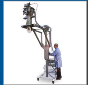
Mobile Vacuum Conveying Systems