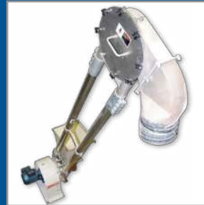
Aero-Mechanical Conveying Systems