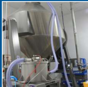
Direct Charge Blender Loading