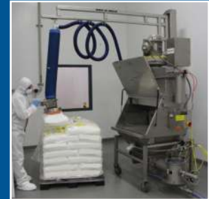
Sanitary Bag Dump Station with LoadLifter™