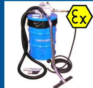
Combustible Dust Vacuum Cleaners

Concerned about combustible dust? Learn more about VAC-U-MAX's full line of Portable, Continuous-Duty, and Central Vacuum Cleaning Systems!!