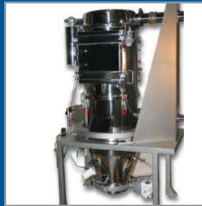
Multiple Ingredient Handling / Batch Weighing