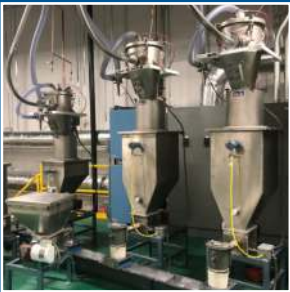
Conveying Multiple Ingredients to Extruders