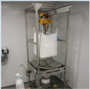
Bulk Bag Loading and Unloading Systems