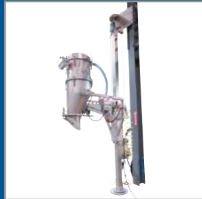
ColumnLift™ Vacuum Conveying Systems