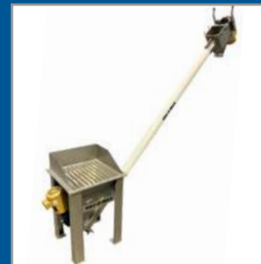
AERO-FLEX Flexible Screw Conveying