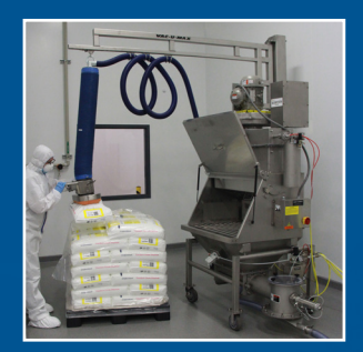
Sanitary Bag Dump Station w∕ LoadLifter™