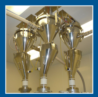
Conveying Ingredients to Food Extruders