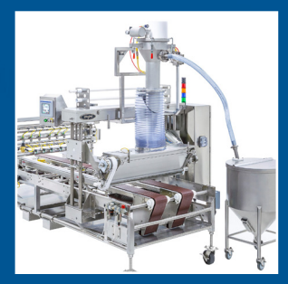
Auto-Refilling Food Ingredients