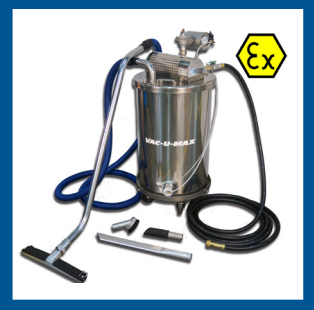
Combustible Dust Vacuum Cleaners