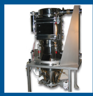
Batch Weighing Multiple Ingredients