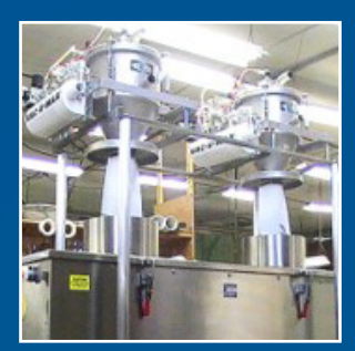
Automatic Refill of Depositors