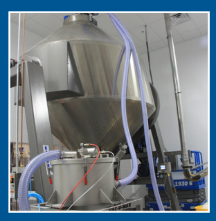
Direct Charge Loading to Mixers & Blenders