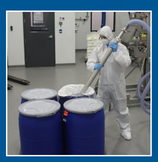
Transfer of Ingredients from Various Sources